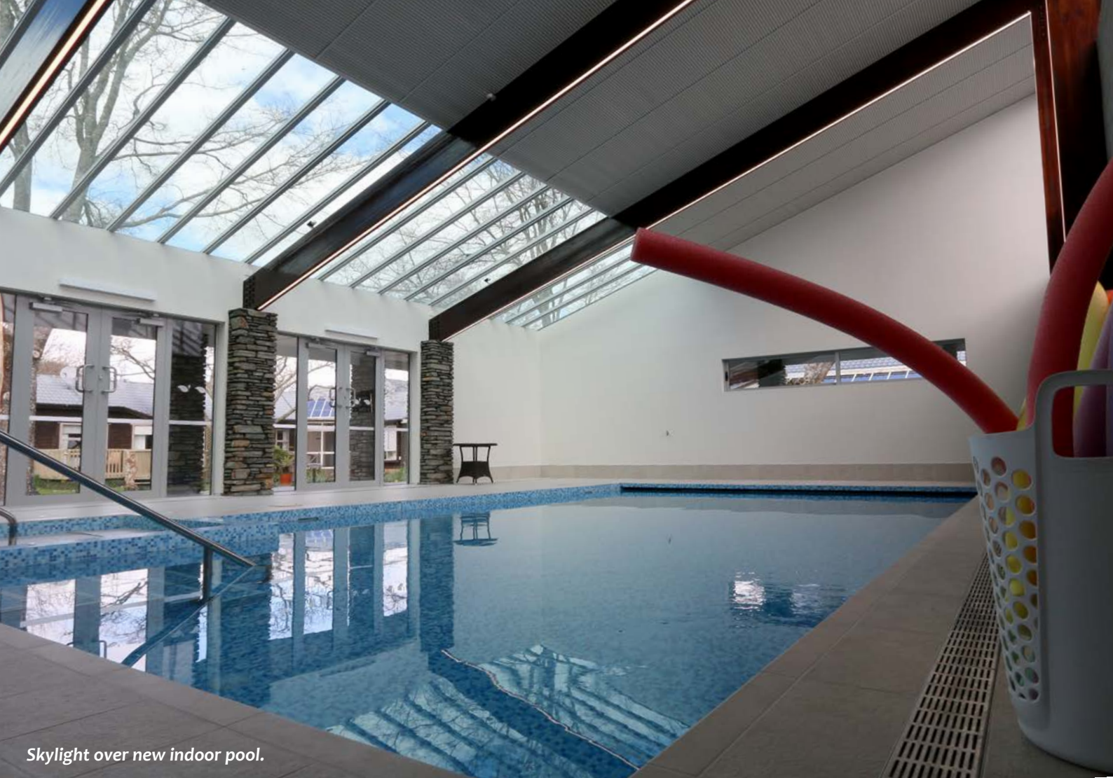
Skylight over new indoor pool.