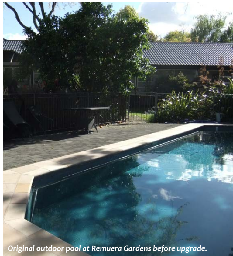
Original outdoor pool at Remuera Gardens before upgrade.

Construction; Carl Woolright, the pool builder; and others to decide on the air distribution duct work and other key concerns.