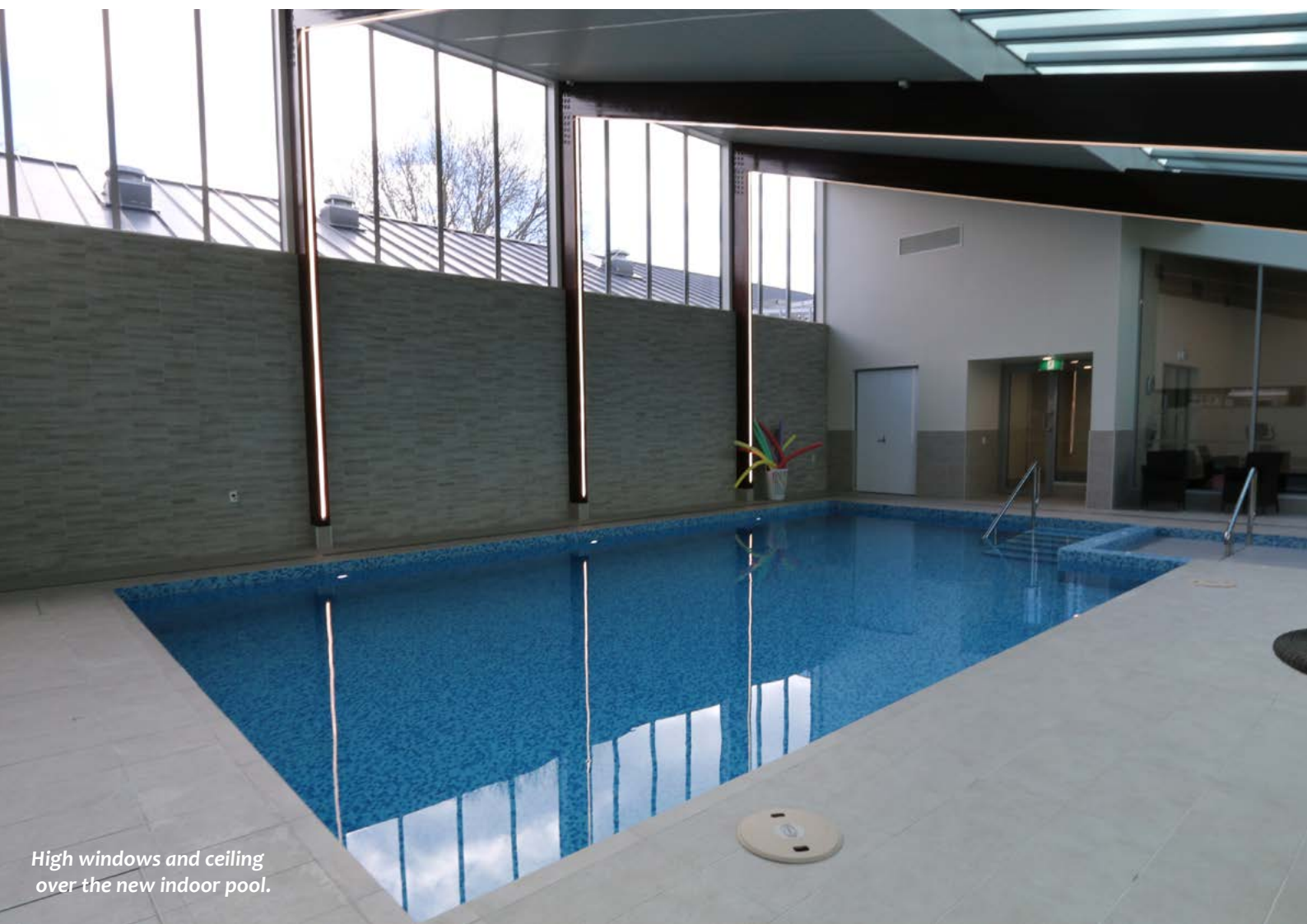
High windows and ceiling over the new indoor pool.